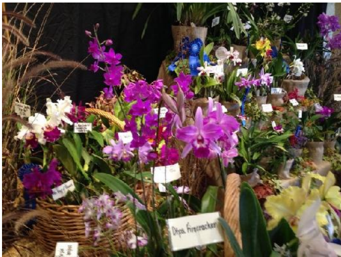
SGVOH Southland Show Display